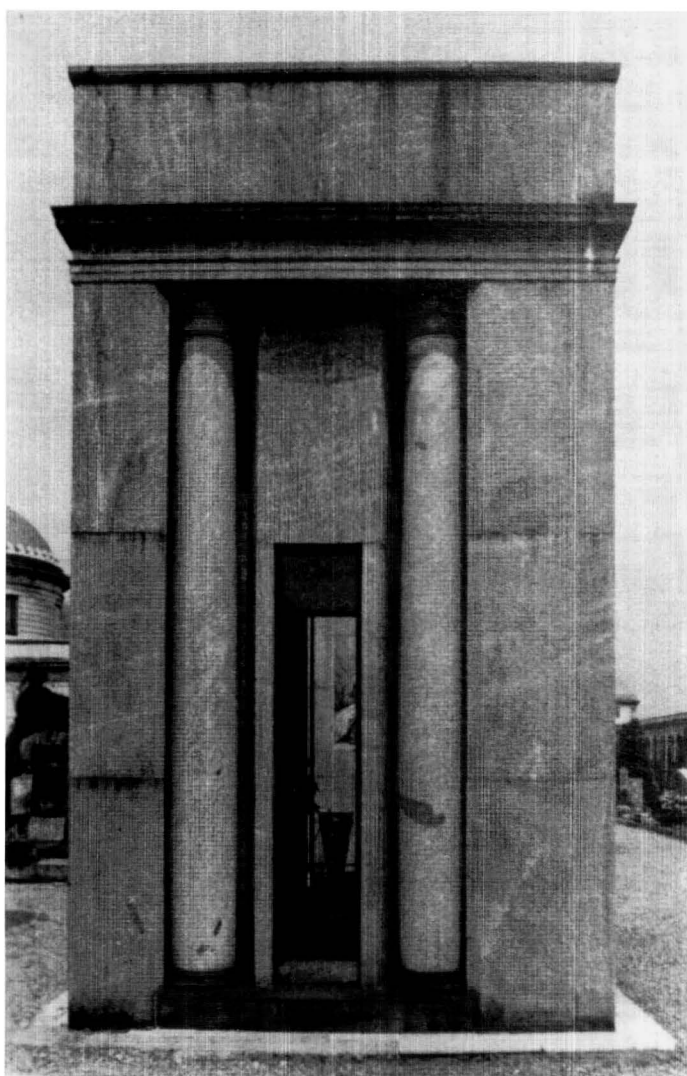
1. Giuseppe Terragni, Stecchini Tomb, Como, 1930, side view.